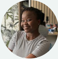
AUBAINE ASENDE CENTRAL AFRICA