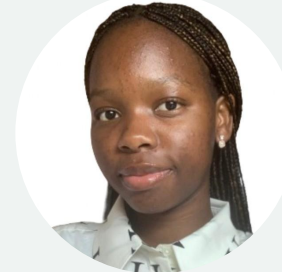
BAME TSHEKEDI INTERNATIONAL